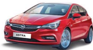
Opel Astra SC