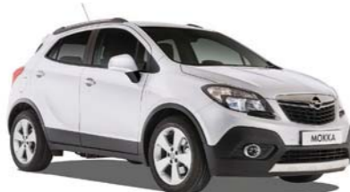
Opel Mokka SC