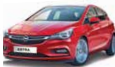
Opel Astra SC 1.4 Petrol & 1.6 Diesel 5 Door