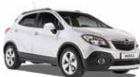
Opel Mokka SC 1.4 Petrol & 1.6 Diesel 5 Door

CANA's Car draw events have been postponed for the near future however we are still collecting subscriptions and will run a car draw report monthly.