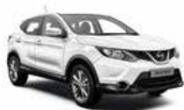
Nissan Qashqai 1.2 Petrol SV & 1.5 Diesel SV Premium