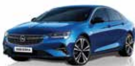
Opel Insignia SC 1.6 Diesel 4 Door